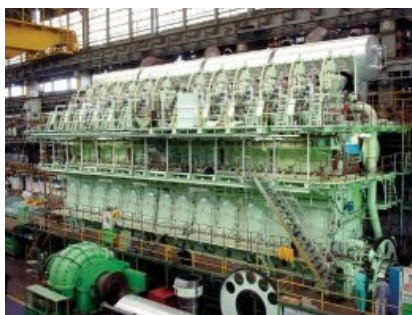
The Hercules-2 project aims to improve ship efficiency through the development of basic technologies for large ships with 2-stroke and 4-stroke marine engines.