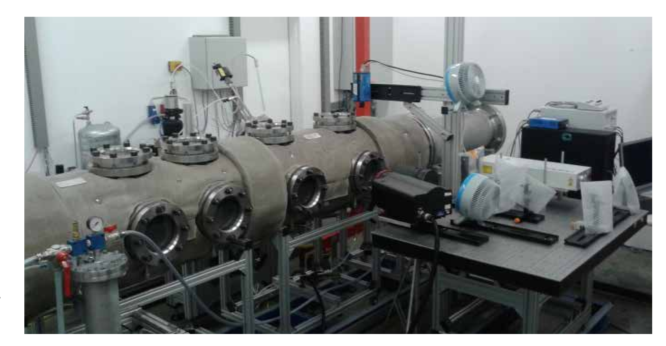
Hot exhaust gas flow rig for invetigstion of urea injection, evaporation and mixing